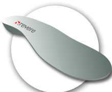
removable comfort footbed

Our supportive contoured footbed is cushioned for all day comfort. A perfectly positioned metatarsal raise in the forefoot helps to reduce that nasty burning sensation under the ball of foot.