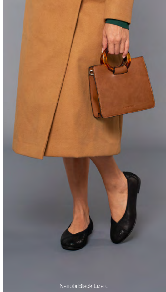
Nairobi Black Lizard